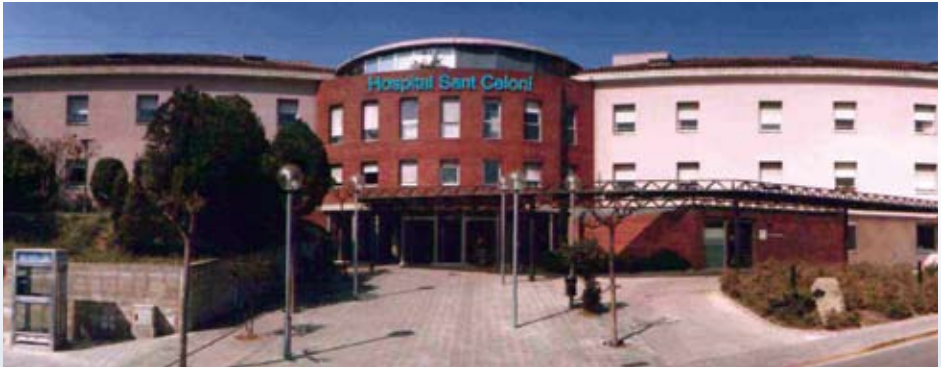
Hospital Sant Celoni