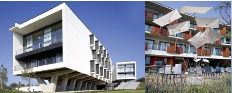
Hotel Meliá Vichy Catalán